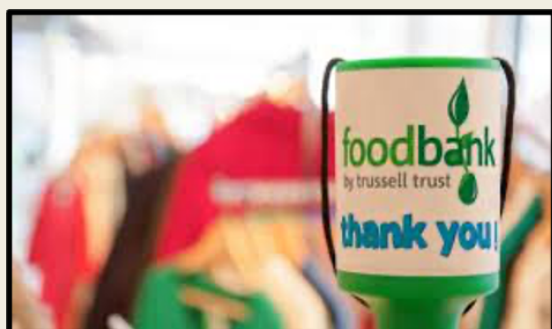
North Enfield Foodbank

https://www.enfield.gov.uk/services/your-council/cost-of-living-support/help-with-managing-health-and-wellbeing