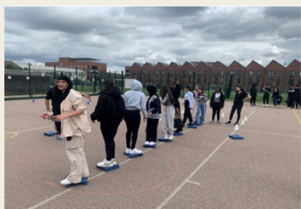
Six form students participating in team-work activities.

In September 2023 we were pleased to welcome the very first cohort of sixth form students into Heron Hall Academy. This is a landmark occasion for the school and allows us to continue the fantastic work from KS4 and GCSE into KS5 and A-Levels.